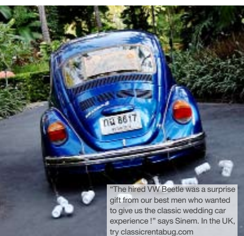
“The hired VW Beetle was a surprise gift from our best men who wanted to give us the classic wedding car experience!” says Sinem. In the UK, try classicroentabug.com