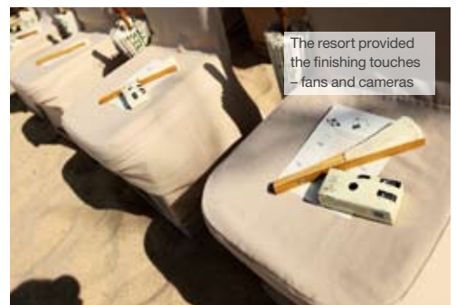
The resort provided the finishing touches – fans and cameras