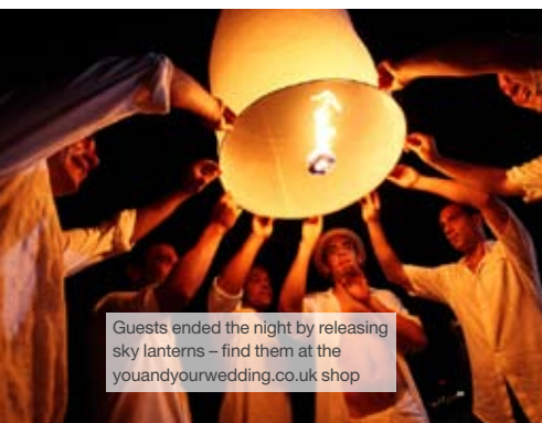
Guests ended the night by releasing sky lanterns – find them at the youandyourwedding.co.uk shop