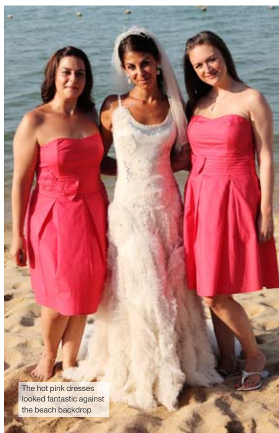
The hot pink dresses looked fantastic against the beach backdrop