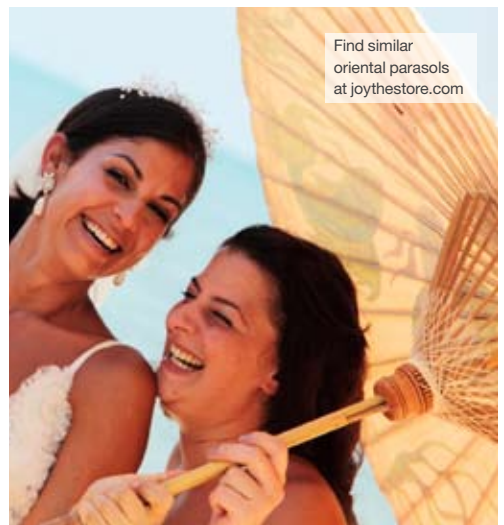
Find similar oriental parasols at joythestore.com